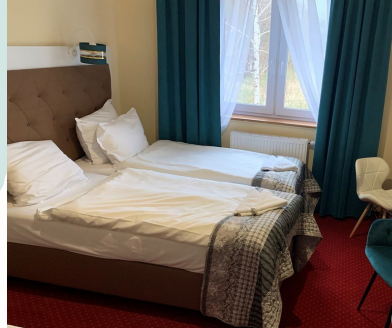
bedrooms for refugees at hotel Admiral

Ukrainian mom with her pre-born baby (7.5months) at Polish hospital. From the relief funds donated to the church, aid was provided to help her both financially and with supplies for her and her baby