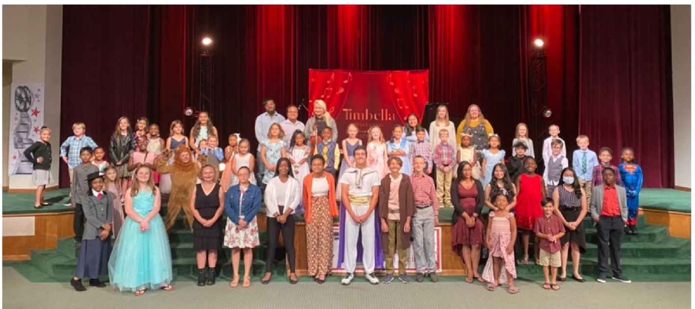
SEPTEMBER, 2021 "Movie" recital.

Adding to the evenings spark, princesses (in character) from The Pursuit of Peace were in attendance. Coming to life, they added to the night's magic. Children were elated, as they were able to meet and greet and take photographs with the princesses.